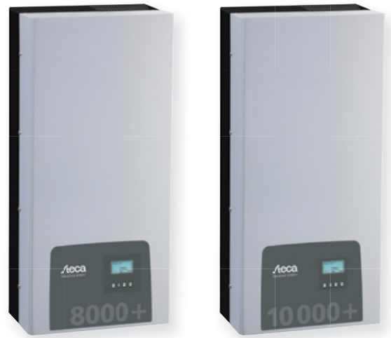
StecaGrid 8000+ 3ph