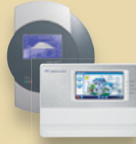
Solar-Log 500/1000™ and Meteocontrol WEB'log Comfort Accessories